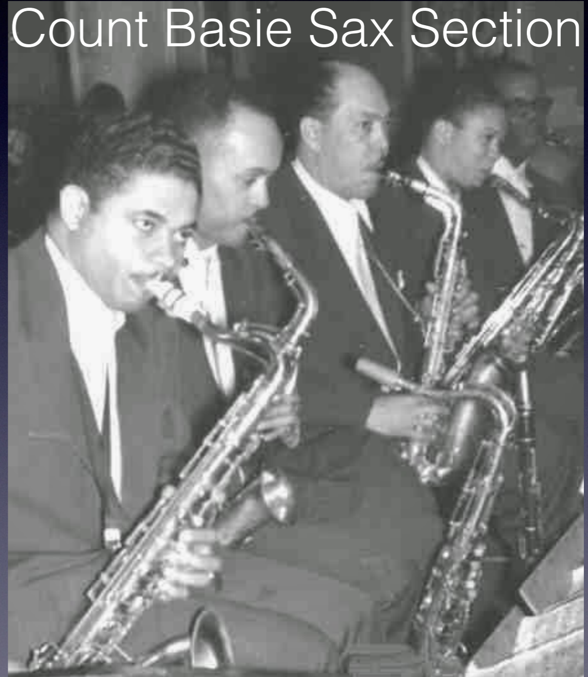
Count Basie Sax Section